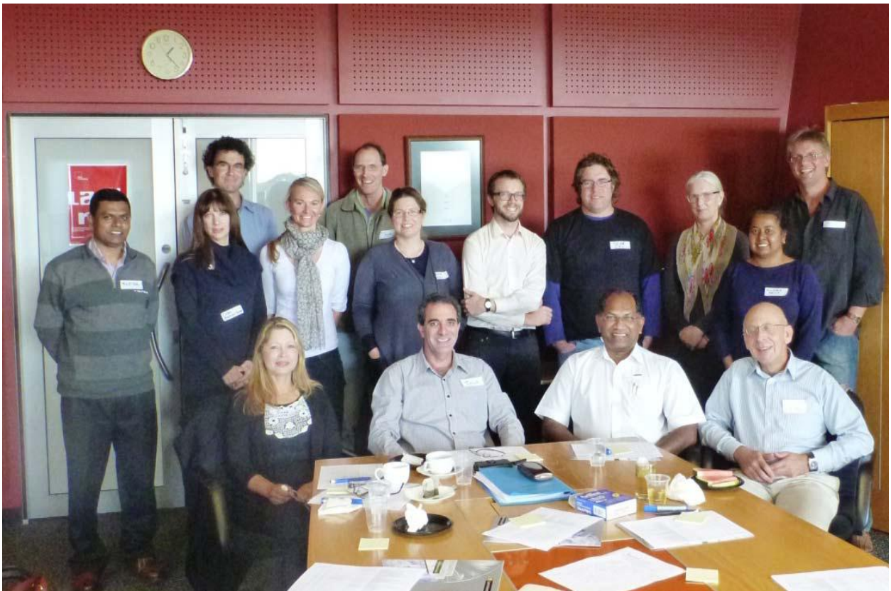
Photo: Internal Capacity Building Event, 13 August 2011

After the euphoria of our ERA 3 ranking subsided a little, the Cluster Executive identified a need to develop a list of the capabilities and interests of tourism researchers throughout Curtin who achieved this world class result. This was deemed an important step to fulfill a key TRC objective of attracting and engaging with tourism industry stakeholders. Only through a collective understanding of our capabilities and interests can we effectively promote ourselves to external stakeholders. The networking event was attended by seventeen participants who brought some diverse perspectives to the table from several schools and centres within Curtin. We were all taken (pleasantly so) by the diversity of the group and were able to develop a substantial list of current capabilities and future research directions (see TRC website for more information).