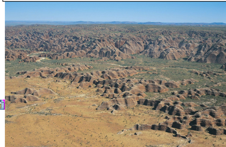
Bungles, Kimberley