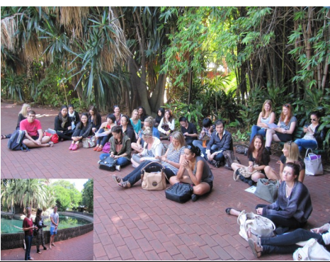
Curtin students at Perth Zoo