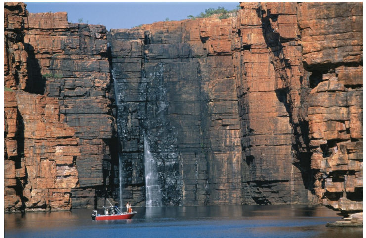
King George Falls, Kimberley