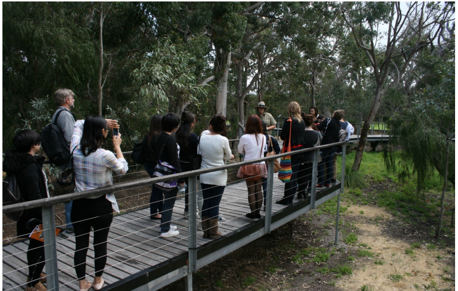
Sustainable Tourism Management students at Yanchep National Park

The student then had an hour and a half to explore the park before heading back to Curtin University on the bus.