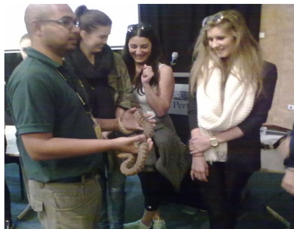
Students at the Perth Zoo