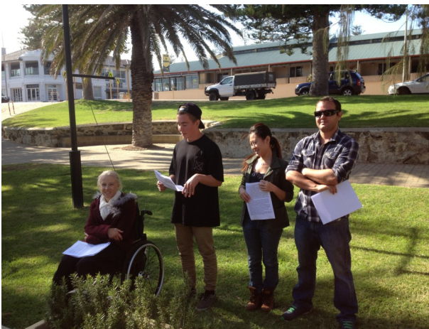
Students at Cottesloe