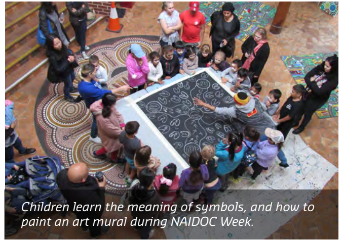
Children learn the meaning of symbols, and how to paint an art mural during NAIDOC Week.