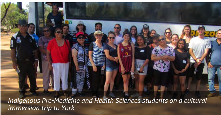
Indigenous Pre-Medicine and Health Sciences students on a cultural immersion trip to York.