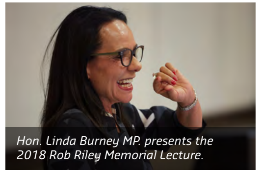
Hon. Linda Burney MP presents the 2018 Rob Riley Memorial Lecture.