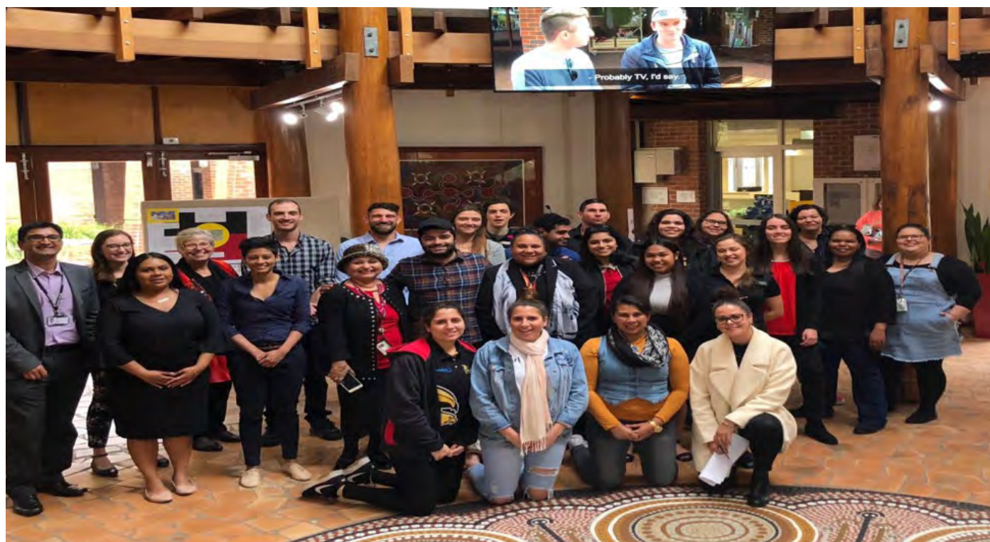
Foundations of Professional Practice presentations.