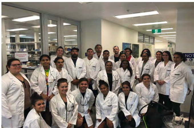
First day in the chemistry labs.