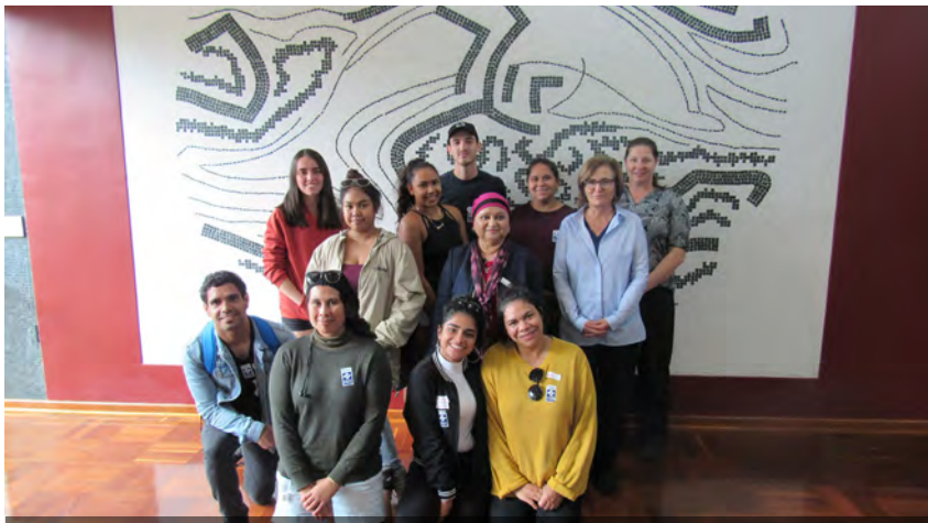
Indigenous Pre-Medicine and Health Sciences students in Adelaide.