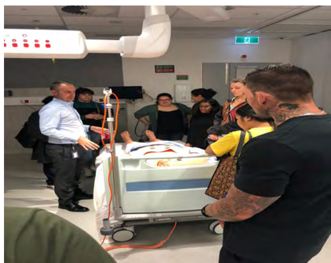
Inside Royal Perth Hospital Emergency Department.