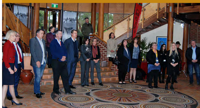
Aboriginal students will be supported by a network of Koordas.