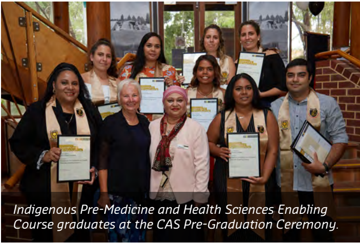
Indigenous Pre-Medicine and Health Sciences Enabling Course graduates at the CAS Pre-Graduation Ceremony.