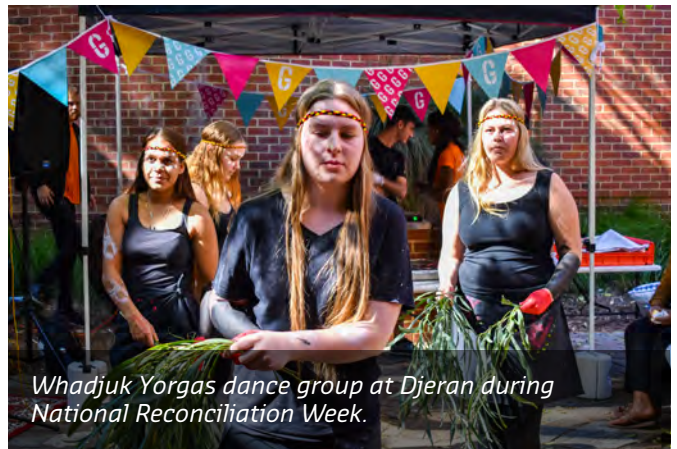
Whadjuk Yorgas dance group at Djeran during National Reconciliation Week.