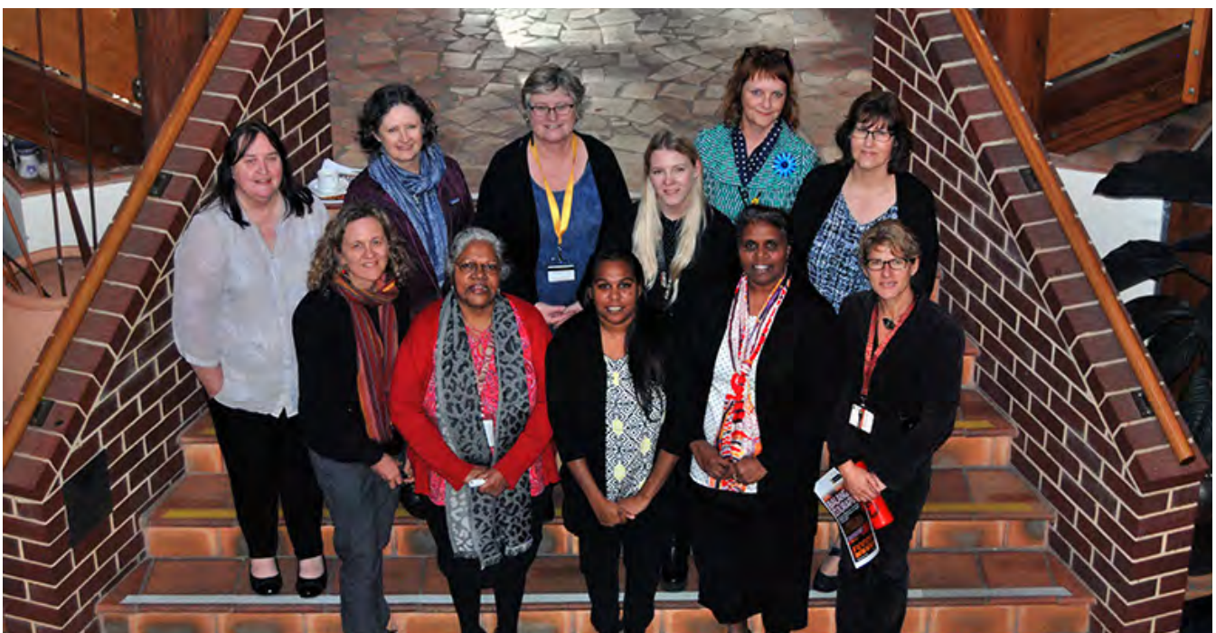
Some of the project administrators and participants.

"Many of our students are not familiar with the culture of university. They often have diverse needs ranging from wanting to gain proof of Aboriginality, to financial support for textbooks, to applying for scholarships and accessing academic support and tutoring. Of course, some of our students need far less support and are successfully navigating around campus and succeeding academically, however many aspects of higher education can make our students feel extremely anxious and disempowered."