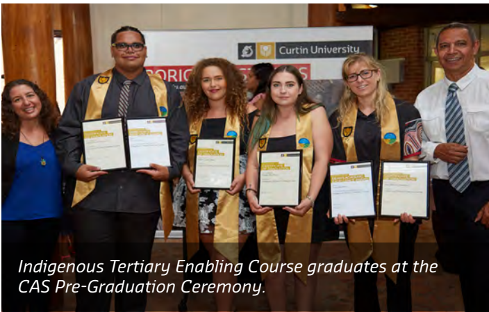
Indigenous Tertiary Enabling Course graduates at the CAS Pre-Graduation Ceremony.