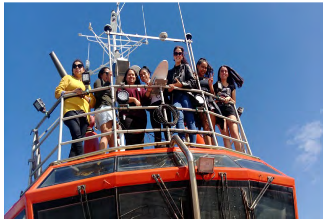
Mentoring boat trip at Fremantle Port.