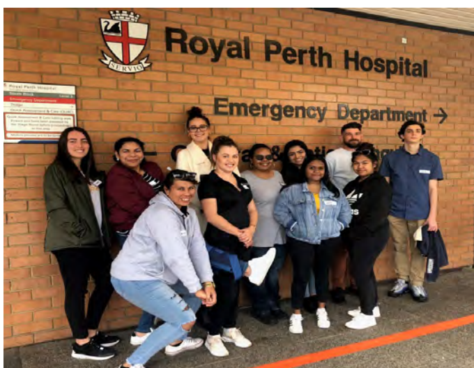
Outside Royal Perth Hospital Emergency Department.