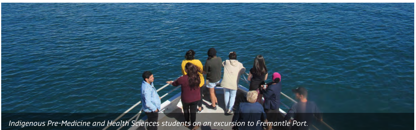
Indigenous Pre-Medicine and Health Sciences students on an excursion to Fremantle Port.