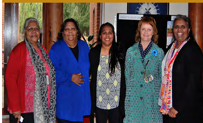
Curtin has long been recognised as a leader in Reconciliation.