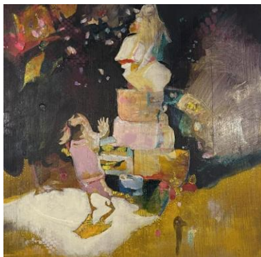
All Come Tumbling Down