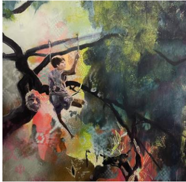
Spirit of the trees watching