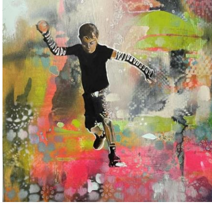
Leap into the Void