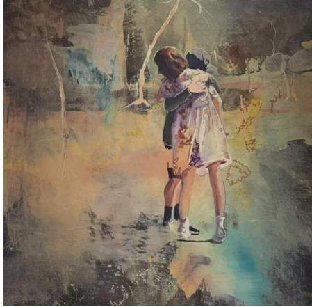
Golden Summers (A homage) - SOLD