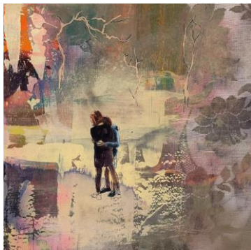
At the Edge of Things II