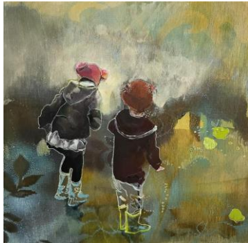
Nothing that Moves on Land or Sea Seems as Beautiful to Me